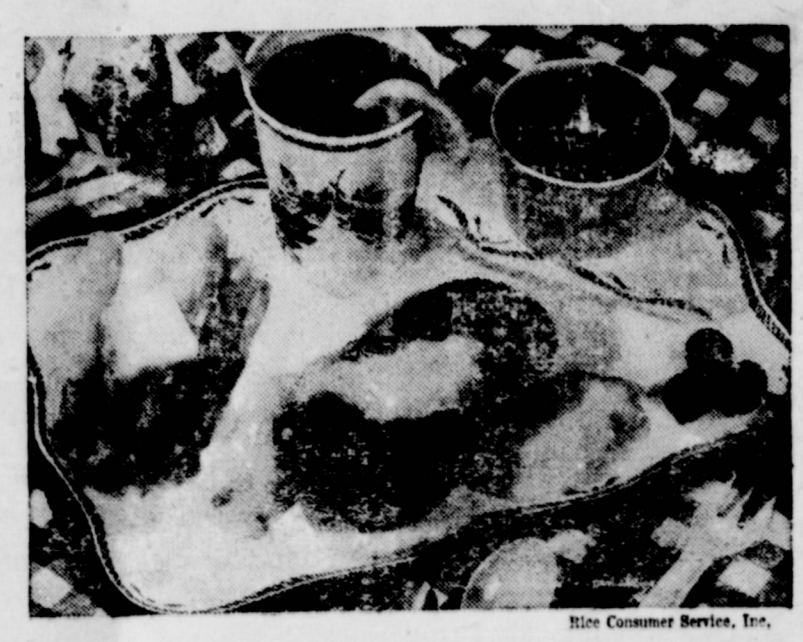
Easy TV Supper Features Chicken Cutlets With Cranberry-Apple Relish

Both the Chicken Cutlets and the Cranberry-Apple Relish for this TV Supper can be made ahead of time. At mealtime the Chicken Cutlets are fried to a piping hot golden brown while the sauce and the asparagus (or other favorite vegetable) are heating. Treat yourself to a real heating. Treat yourself to a real lazy and relaxing evening by serving this meal on paper plates or trays and end dish washing worries for the even-ing! You'll have fun fixing and serving this meal. You may want to treat your friends to this TV supper idea whenever they come around and you don't want to stay in the kitchen!