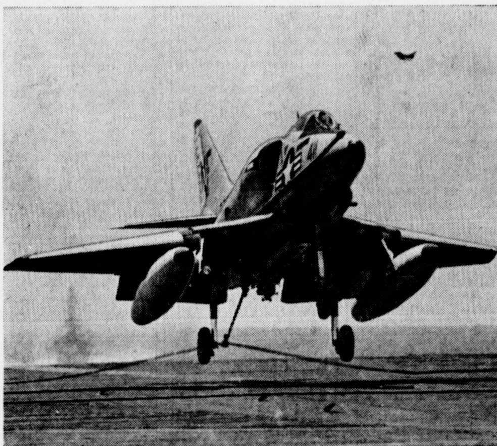
A CRUCIAL SPLIT SECOND is captured by a photographer aboard the carrier USS Hancock as an A-4 Skyhawk, world's smallest attack bomber, catches the No. 1 arresting cable while landing after a mission over Vietnam.