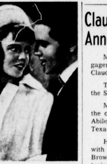
Elvis has a new girl to crown to in "Double Trouble" in the person of glamorous new British "find," Annette Day, who makes her motion picture debut in the song-filled Panavision and color attraction from MGM. John Williams, Yvonne Romain and the Wier Bros. co-star in the action-filled comedy-drama in which Elvis becomes involved in a diamond smuggling plot.

LOST: Subsurface logline tool in city of Winters. 8-ft. length, 1 3/4 diameter. Any information concerning this tool contact GO Services, Inc., Area code 915, OW 2-8000, collect, Abilene, Texas. Reward. 1tc