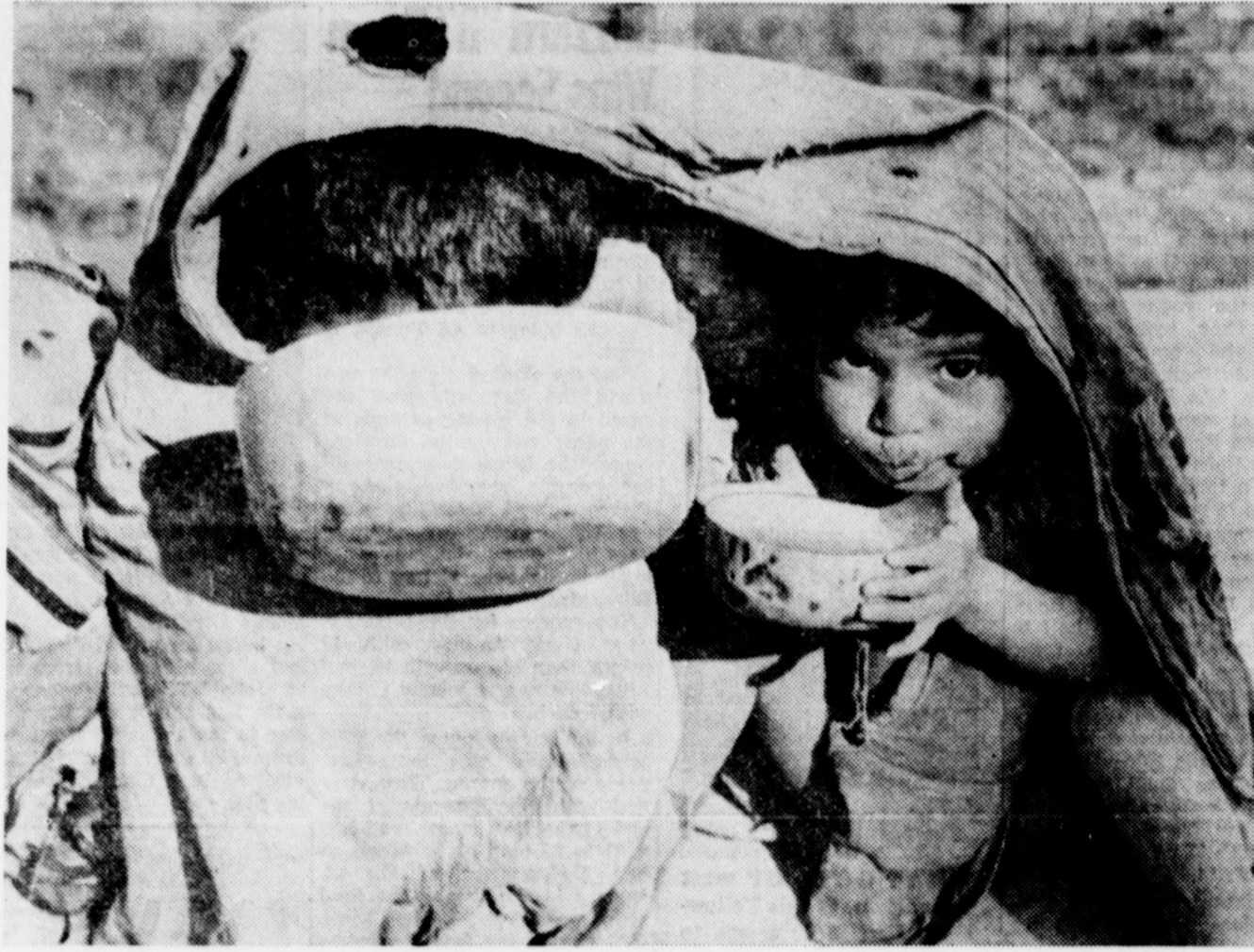
ALMOST ANYTHING WILL DO for food and shelter when you're up against starvation. These youngsters in India's Eastern Bihar State enjoy a meal of milo and milk at the roadside school in Maujipur Village, while shielding themselves from the hot sun with a worn piece of cloth.