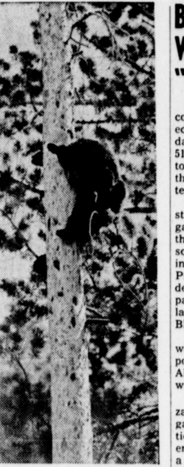
WHAT GOES UP must come down, as this Yellowstone Park bear seems to be pondering. Do bears too have second thoughts about heights?