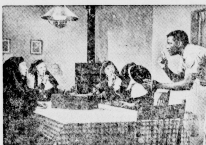
Sidney Poitier about to play a choice recording for a group of nuns whom he is helping to build a chapel in the desert. Scene is from "Lilies of the Field," a United Artists release, produced and directed by Ralph Nelson. It shows Wednesday and Thursday at the State Theatre.

DRIVER MUST HEED SAFETY RULES Even in a car that is mechanically perfect, the driver also must heed the rules of safe driving—especially in winter. The Texas Safety Association urges you to reduce speed, allow more distance between moving vehicles, and make your starts and stops gradually, and signal turning intentions.