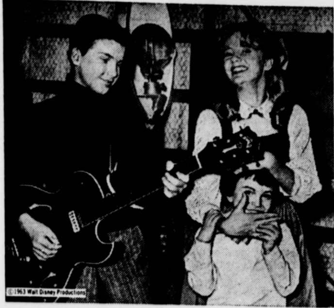
MUSIC MAKERS Hayley Mills and Eddie Hodges keep things strumming in Walt Disney's "Summer Magic," in color by Technicolor. Showing Friday, Saturday and Sunday at the Fiesta Drive-In. Also starring are Burl Ives, Dorothy McGuire, Deborah Walley and Peter Brown.