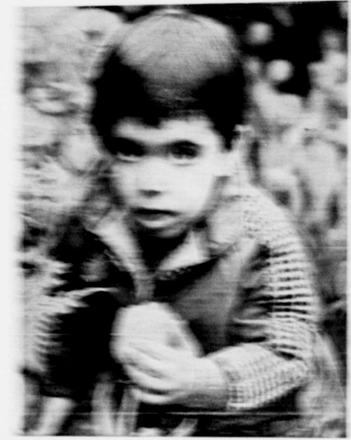
Young child... at the Winters Enterprise...