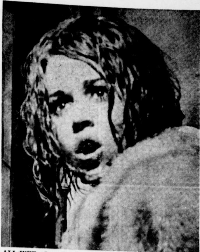
ALL WET —Jane Fonda looks worse for wear after a mud puddle and hose bath in the Hollywood film, "Period of Adjustment."