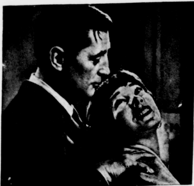
Robert Mitchum and Shirley MacLaine play a visiting "square" from Nebraska and an off-beatnik from Greenwich Village respectively in "Two For The Seesaw," which will show Sunday, Monday and Tuesday at the State Theatre. The picture, a United Artists release filmed in Panavision, was directed by Robert Wise.

Monday May 6 Choice: Hot dogs or pimento cheese sandwich, french fries, catsup, peaches, chocolate cake, milk. Tuesday May 7 Beef roast, Brown gravy, Buttered rice, candied yams, apple sauce, Chocolate chip cookies, hot rolls, milk. Wednesday May 8 Weiner boats, pinto beans, Tomatoes and macaroni, Ice cream, corn muffins, milk. Thursday May 9 Fried steak, gravy, tossed salad, corn, strawberry shortcake, hot rolls, milk. Friday May 10 Salmon Croquettes, tarter sauce, Cream peas, Cabbage slaw, Cherry pie, Corn muffins, milk.