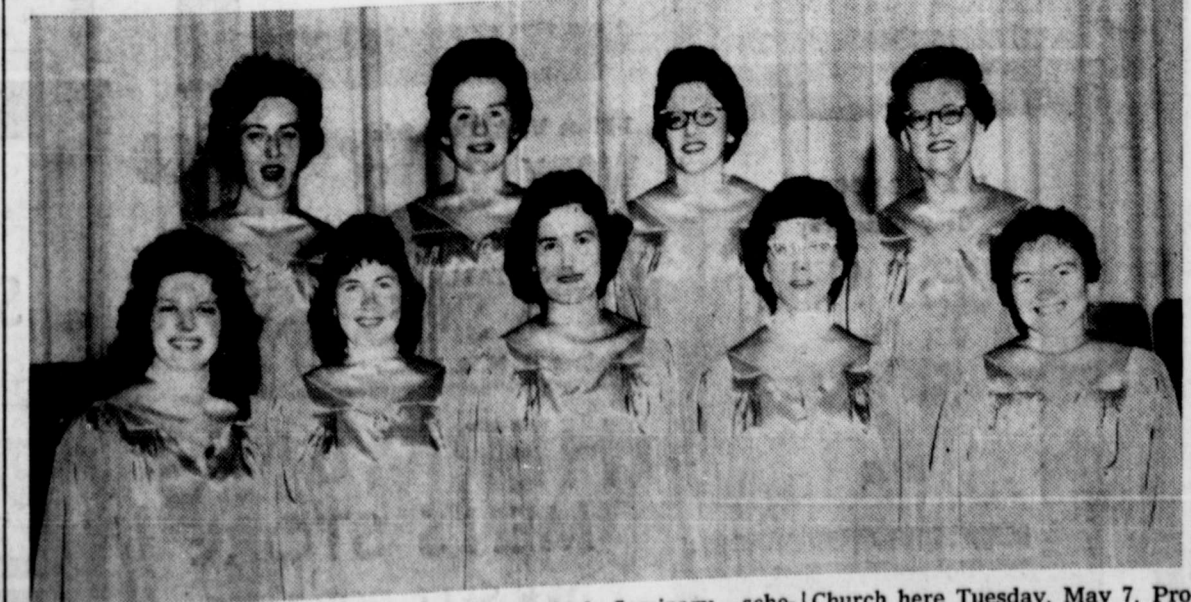
TO APPEAR HERE—This is the women's ensemble of the 20-member choir of the Golden Gate Baptist

The public is cordially invited to attend.