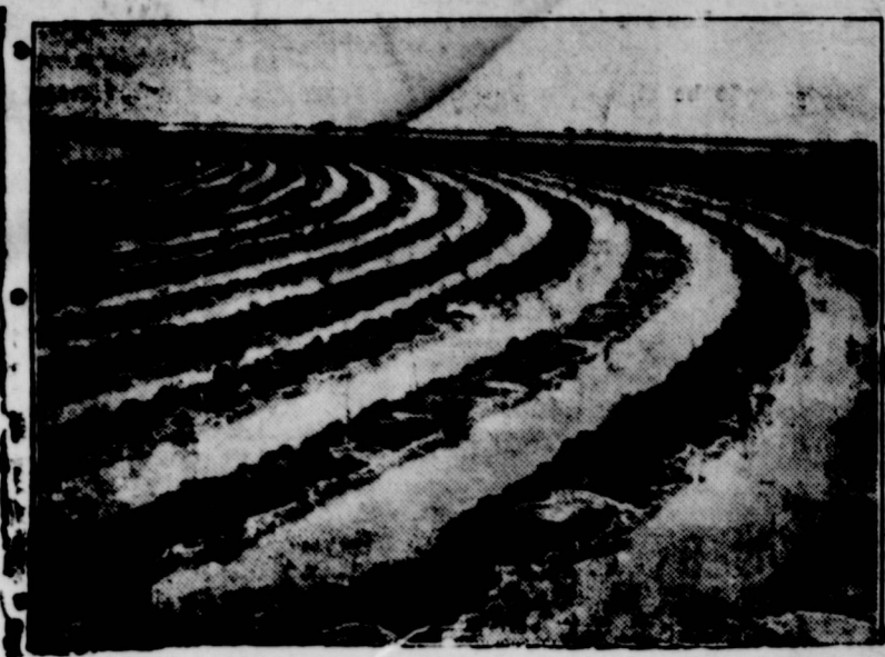
Farming on the contour together with the proper management of crop residue and stubble mulching help to hold water where it falls.

The First National Bank Member F. D. I. C. Gorman