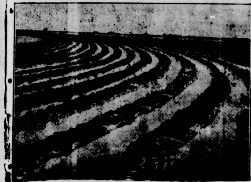
Farming on the contour together with the proper management of crop residue and stubble mulching help to hold the water where it falls.