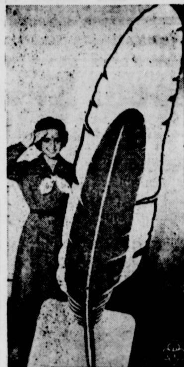
Girl Scouts all across the country salute the bigger Red Feather—symbol of the large scope of Community Chest activities made larger by the cooperation of all good citizens.