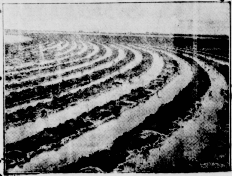
Farming on the contour together with the proper management of crop residue and stubble mulching help to hold water where it falls.

First National Bank Member F. D. I. C. Gorman