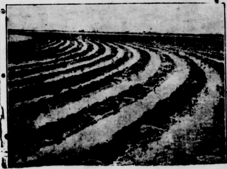
Farming on the contour together with the proper management of crop residue and stubble mulching help to hold water where it falls.

First National Bank Member F. D. I. C. Gorman, Texas