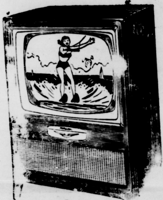
RCA Victor Glodstone 21. 261 sq. in. picture. Lowest price RCA Victor sets with new "A-Plus" Picture Quality. New "High-Side" Tuning. Mahogany finish. Walnut or lined oak cabinet finishes, extra. Super model.

New Spring Dresses, Suits & Toppers for Easter For Easter a new Spring Hat We have the latest Styles Altman's Eastland Texas