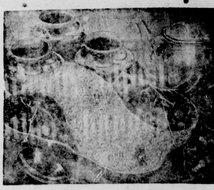
Almond Chicken With Rice

A - If the veteran had been discharged sooner, for a serviceconnected disability, that would be possible, yes. He could be eligible for pension.