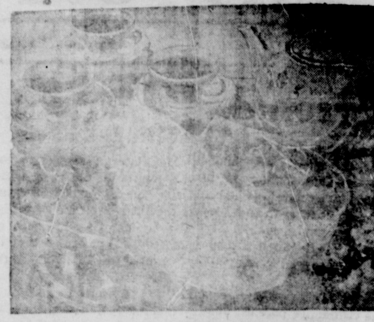
Almond Chicken With Rice

Chinese Chicken Almond With Rice, a delightful delicately fla-yored dish with chicken, celery topping, is sure to please your family. It makes an attractive "one main dish type meal" and is easily served to a crowd.