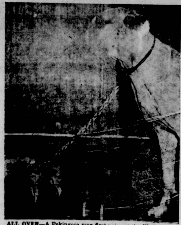
ALL OVER —A Pekingese won first prize at the Westminster Kennel Club dog show in Madison Square Garden, and these losers were mighty sad. The Chihuahua, the show's smallest dog, and the Great Dane, almost its largest, are chained together to add some local color.