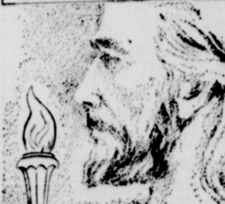
In all these things we are more than conquerors through him that loved us. ROM. 8:37

CITATION BY PUBLICATION THE STATE OF TEXAS: To any Sheriff or any Constable within the State of Texas — GREETING: