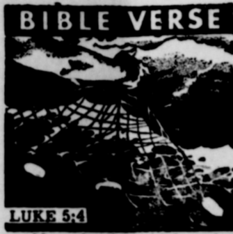
LUKE 5:4 Now when he had left speaking, he said unto Simon, Launch out into the deep, and let down your nets for a draught.

"Keno" came from the gambling game of the same name, and cowboys often use the word to mean everything is all right.