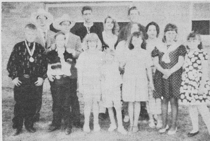
COMPETE AT DISTRICT - Sixteen 4-H'ers from Yoakum County competed in district contests at the annual 4-H Roundup held recently in Levelland.