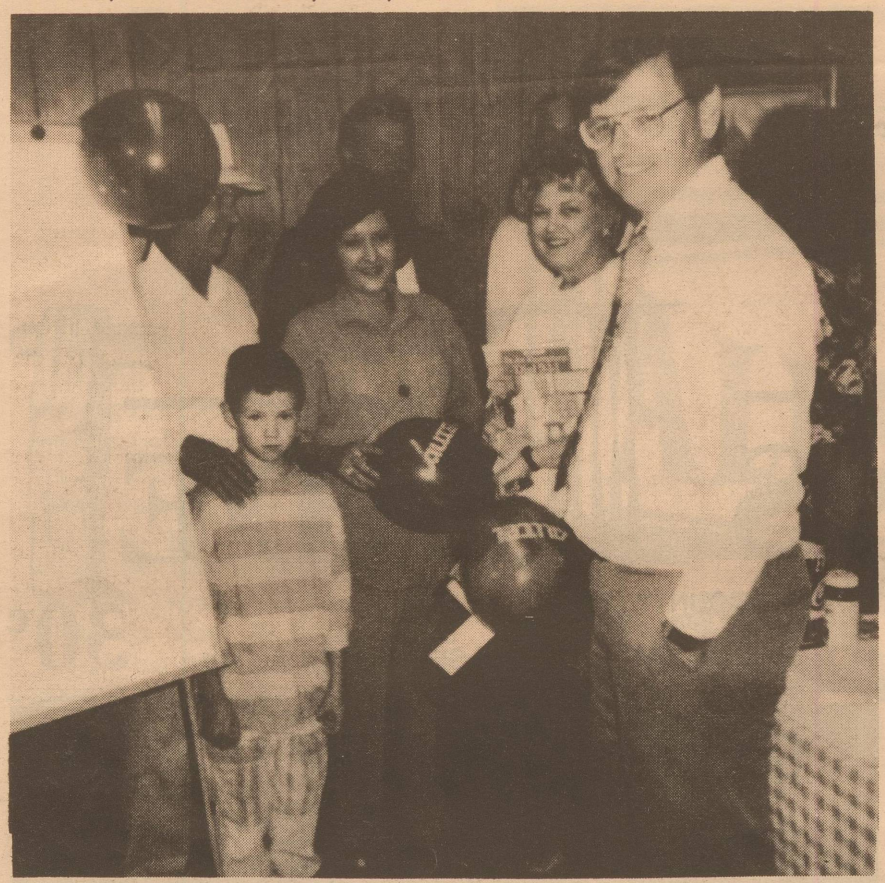
GUESTS OF ALLTEL MEETING