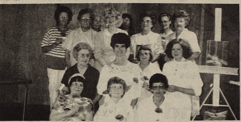
1990-91 YOAKUM COUNTY ART ASSOCIATION MEMBERS AND OFFI-

CHILDREN'S SUNGLASSES.....50¢ "JR. RUBBER WAYOUT".....$2.69 "TERMINATOR" SUNGLASSES.....$2.99 "U.V. COVERALL" GLASSES.....$3.99 "ASPEN" SUNGLASSES.....$5.99 SUNGLASS SPORTS CORDS.....59¢ OR FREE WITH SUNGLASSES