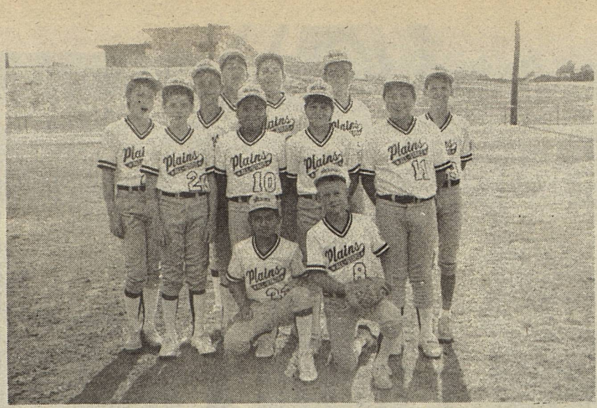
PLAINS LITTLE LEAGUE travels to Brownfield for tournament.

MERLE NORMAN COSMETIC STUDIOS NELSON PHARMACY 805 Tahoka Road 637-3533