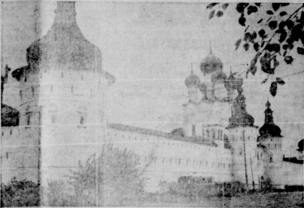
ANOTHER VERSION—The onion-domed towers on those massive walls give an appearance of ancient Russia to the Soviet city of Rostov-Yaroslavl, which is 1,100 years old. This is the town's Kremlin, following restoration of its architecture dating back to the 16th and 17th Centuries. Kremlin means "fortification," and there is a Kremlin in most old Russian towns, as well as the famed one in Moscow.