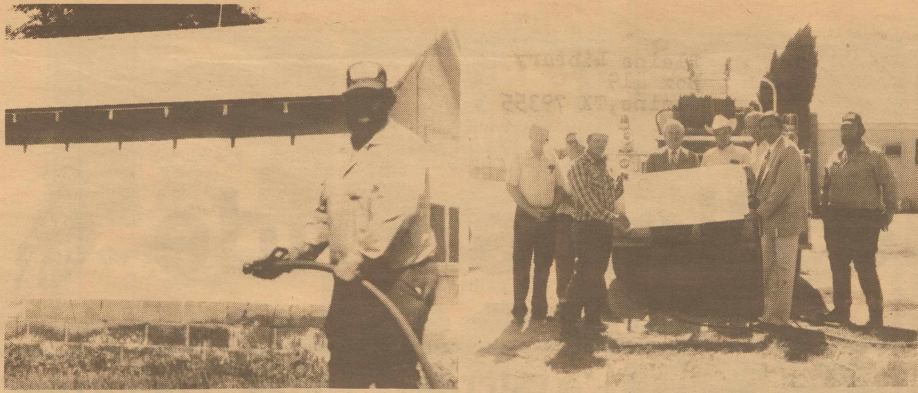
"KEEPING UP WITH THE TIMES" — Plains Volunteer Fire Department demonstrated their newly purchased WEPS unit Tuesday, July 8, during Open House. The equipment was purchased with the help of a $2500 check from Texas Forest Service.