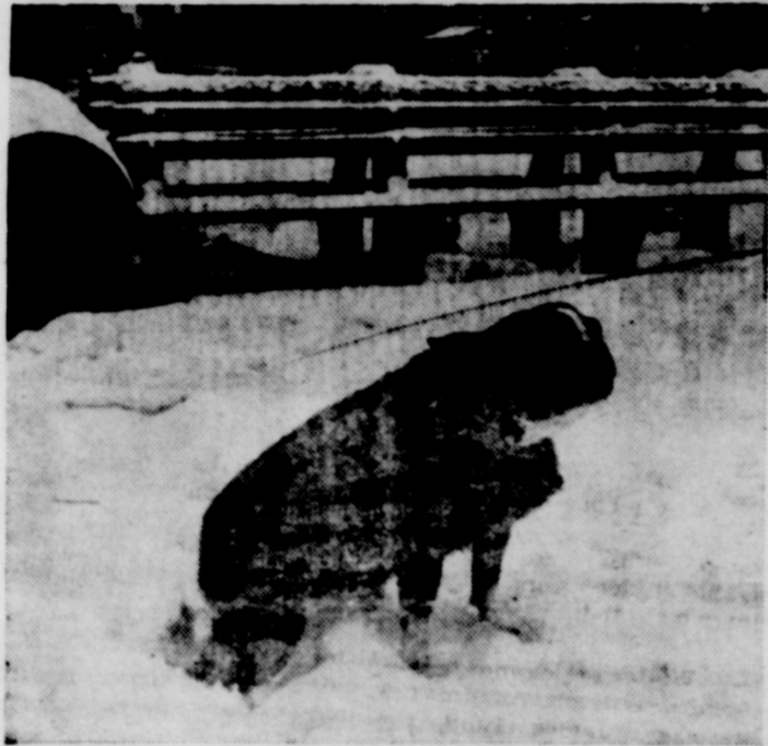
WELL COVERED—The old year went out in a white mantle, as far as Beebe, a Boston terrier in New York, is concerned. He is wearing his fancy mink coat, but he does not like the snow that temporarily covered Times Square.