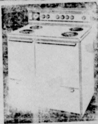
Enjoy carefree holiday cooking with a modern automatic electric range. Automatic features relieve you of post-mealtime clean-up chores.

You'll enjoy the holiday season more with the help of your dependable electric service and work-saving electric appliances. A modern automatic electric range watches over your holiday cooking for you, giving you more time to be with your family and guests. An automatic electric dishwasher and a waste disposer make quick work of your after-mealtime clean-up chores. Yes, at holiday time (or any time) you'll spend less time in the kitchen, have more time for other things, when you make full use of your dependable electric service and work-saving electric appliances. See your favorite electric appliance dealer soon.