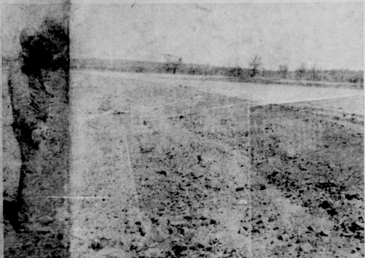
A good terrace is one which will carry a flood and yet be easily farmed. Terraces shown here are on the Paul Norris farm northeast of Carbon, and are an example of terraces with big water capacity and smooth flat side slopes adapted to modern farming equipment. Steps in the construction of these terraces are shown in the lower photos.