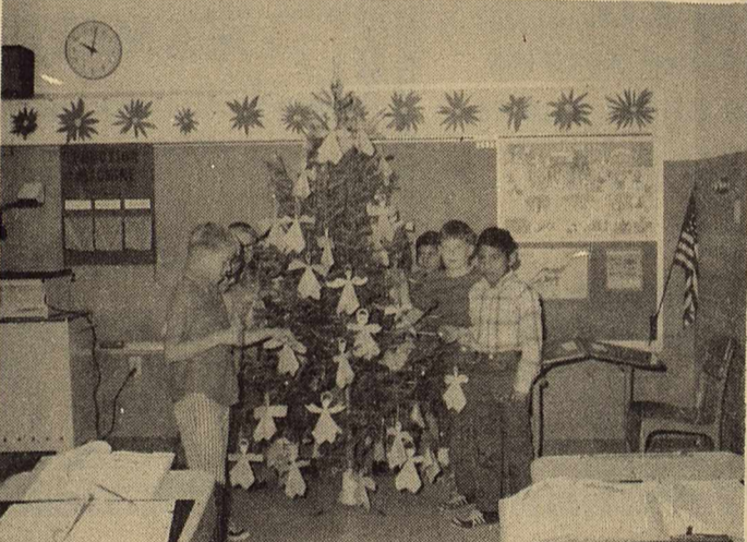
Students in Mrs. Engle's class are pictured putting the final touches on their Christmas tree. Now all they have to do is wait for Christmas Day to hurry up and get here.