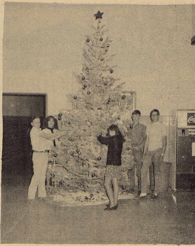
Junior High students put finishing touches on Christmas tree.