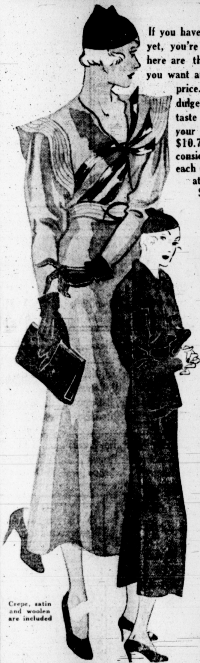
Crepe, satin and woolen are included