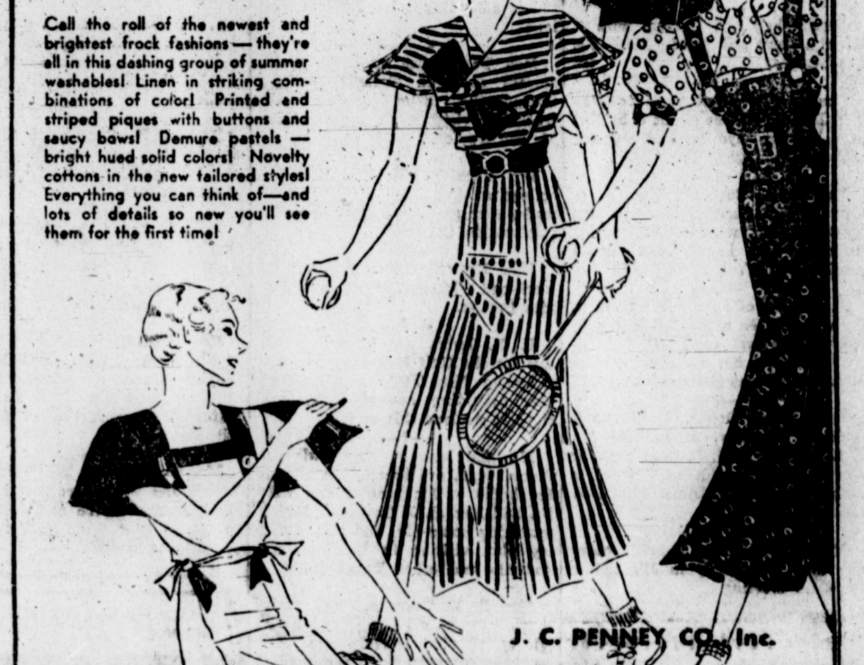
J. C. PENNEY CO., Inc.

MAN, THIN AS RAIL, IRON GIVES PEP AND WEIGHT "I was tired, run-down and thin as a rail. Since taking Vinol (Gonitonic) I sleep well, feel better and have gained 19 lbs."