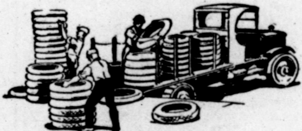
"Giving to the fabric tire user fresh, live tires. Being made now. Being shipped now."