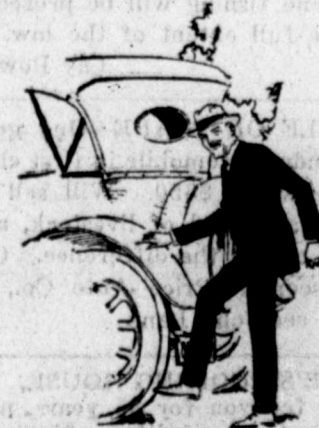
"His first experience with U. S. quality standard tires."

United States Tires United States Rubber Company E Z Tire Company Colorado, Texas