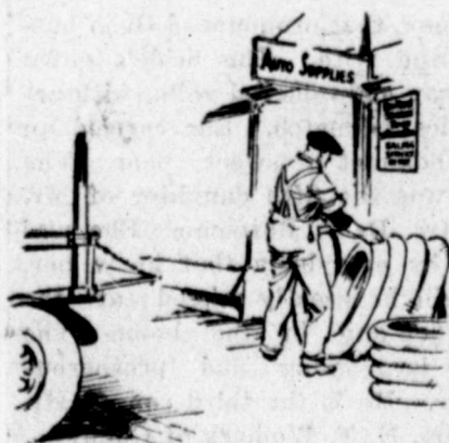
"Fresh, live U. S. Tires come direct to the dealer from his neighboring Factory Branch."

Giving your dealer a continuous moving stock of new, fresh tires built on the certainty of quality first every time