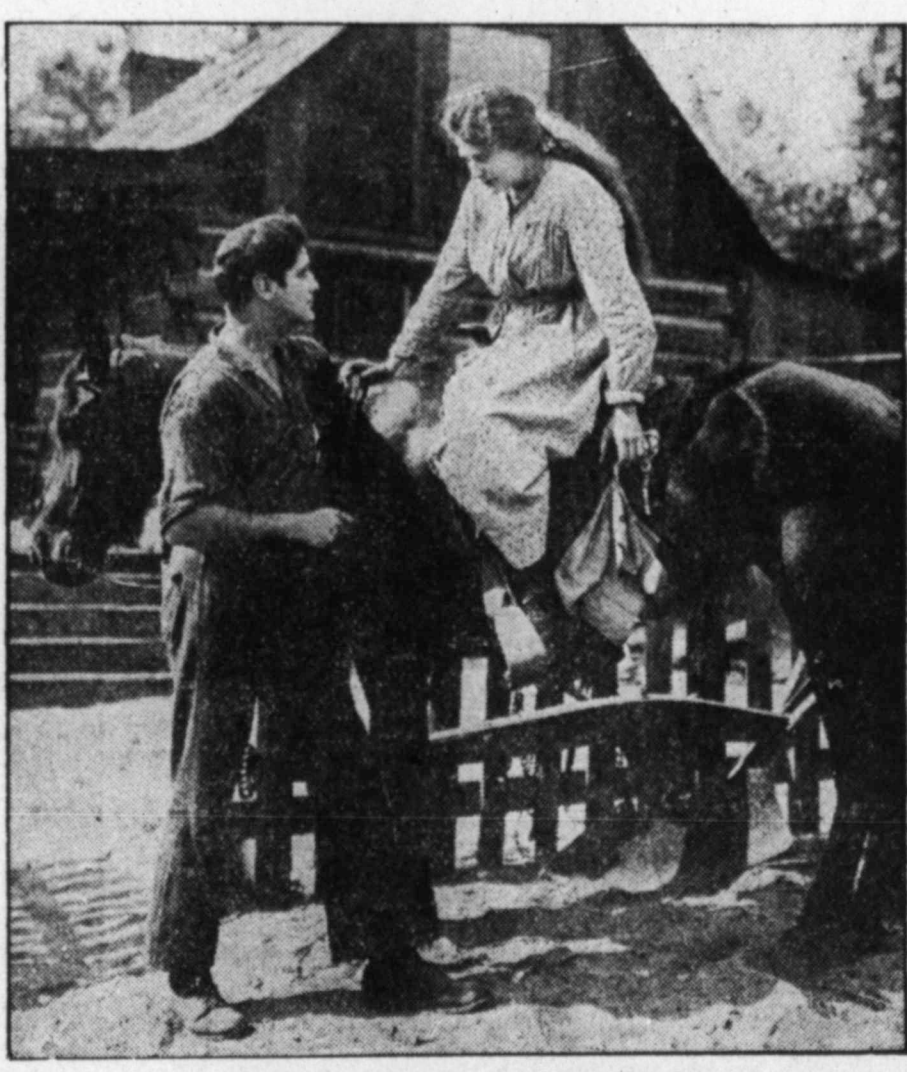
Admission 25 and 55 cents