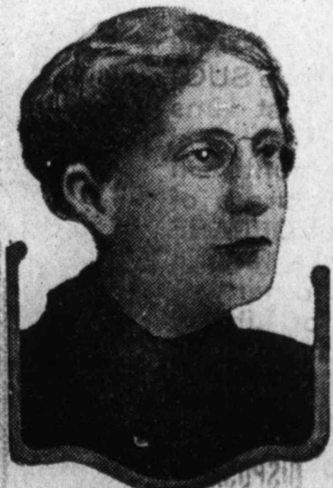
Frances E. Willard.

Civil war as lieutenant colonel of the 143d regiment of Illinois volunteers and later served two terms as governor of Kansas. He was a Republican, but his party thought him too warm a friend of the prohibitionists and he was defeated for re-election in 1882. Accepting the Prohibition nomination, he went into the campaign with all his vigor and delivered stirring speeches all over the country, especially paying attention to New York state, where the fight between James G. Blaine and Grover Cleveland had made things very warm. St. John was out to beat the Republicans, and he succeeded, for the Prohibition vote was large enough to let Cleveland win