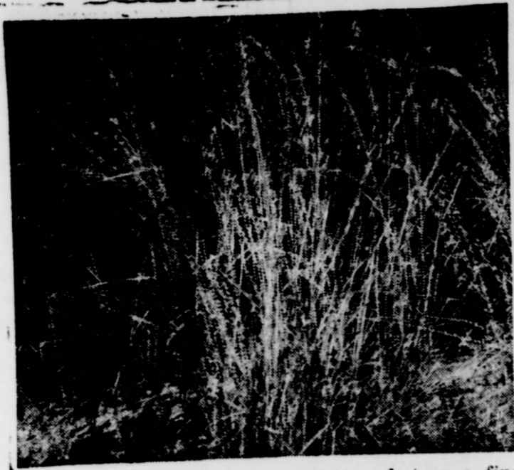
ARTISTIC GRASS — As picture-perfect as a fine etching, is this gallery-quality exposure of native Eastland County grass at its best. Side-oat grama plant showing full seasons growth without being grazed. I