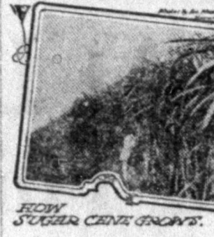
SUGAR CANE GROWING

amongst them those that have not gone up in price in spite of the war.