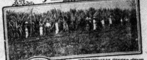
GATHERING SUGAR CANE

The European war is not an unusual evil; nor yet is it an unshared blessing for this country. We shall not attempt to go into the ethical side of the question at all, nor shall we discuss "war brides", munition plants or other similar phases of the situation. We shall look at the war purely from the standpoint of prices for raw products, either produced here in this country or imported from foreign countries. And