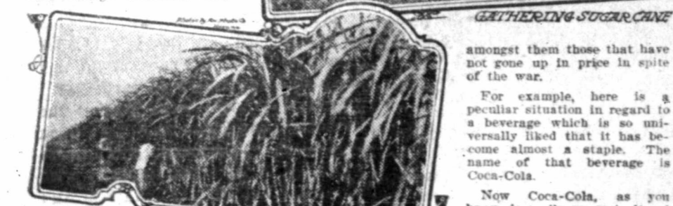
GATHERING SUGAR CANE

The European war is not an unmitigated blessing to our country. We shall not attempt to go into the ethical side of the question. We will say that we believe the war is a blessing to our country in many respects. We shall look at the situation from the standpoint of prices for raw products, either produced here in this country or imported from foreign countries. And