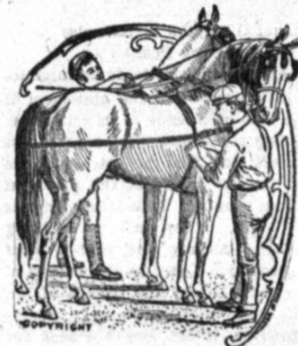
Figure With Me On Your Next Saddle

Would you prefer harness that is made to wear? Every stitch of our harness is right. We guarantee our harness, both the light and the heavy kinds. Our stylish harness is the best and the cheapest for driving. You can always depend upon it, and it costs the least