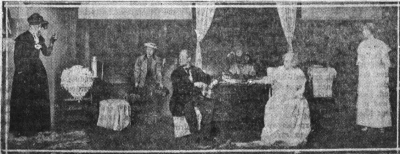
Scene From 3rd Act of "LAVENDER AND OLD LACE" A Comedy Drama in 4 Acts that Appeals to All Classes

Considered by the best critics to be the highest class Traveling Stock Company playing the Southwest this season. Other plays to be presented, "Barriers Burned Away" and "A Bachelor's Honeymoon"