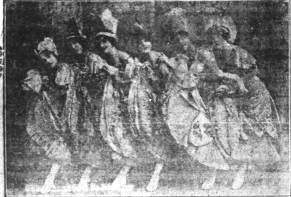
Taumanian Van Demain Troupe-and other big Vaudeville Attractions-State Fair of Texas-Dallas. October 17 to November 1, 1914.