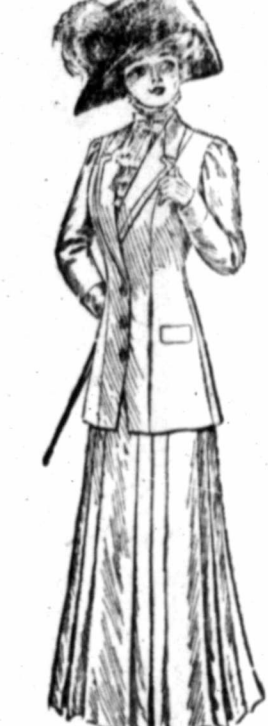
es' Home Journal