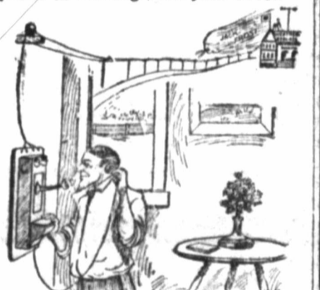
Getting Information About Jack Frost.

To talk with the weather man as he listens to the clouds whisper their plans for the future is one of the startling and valuable uses of the telephone. Advance intelligence enables the farmer to successfully combat the Frost King and to shelter his products from the storm and rain, and the telephone is a powerful ally of the farmer in dealing with the elements of Nature. The following cut illustrates the use of the rural telephone in battling with Jack Frost.