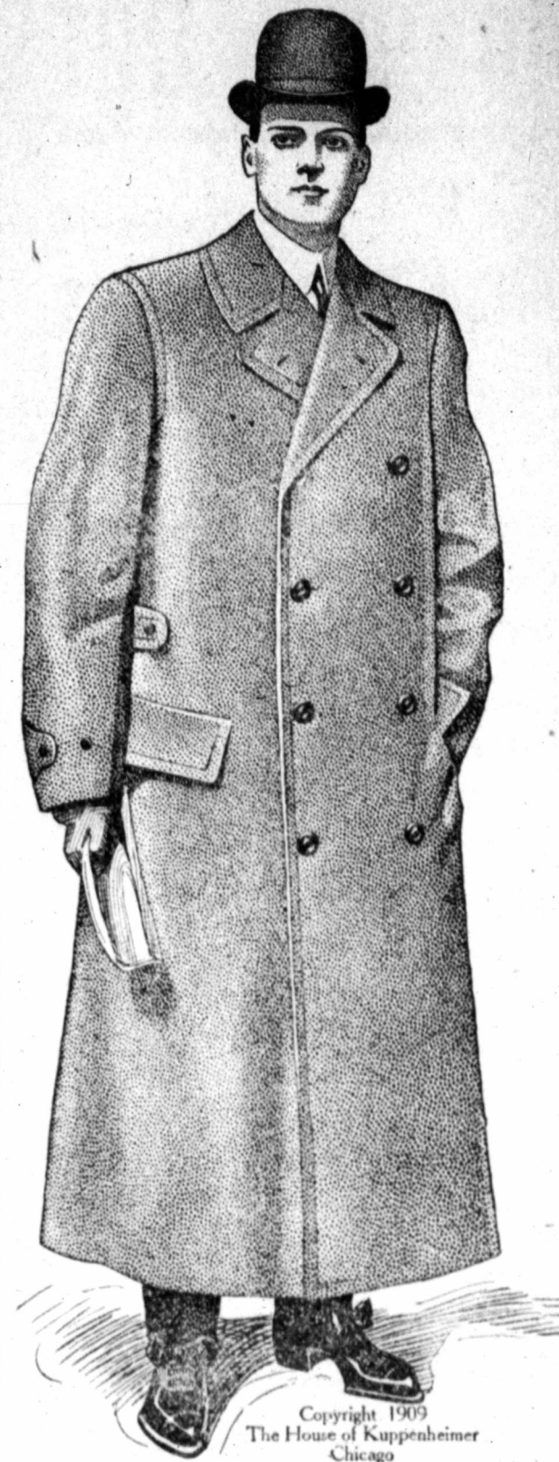
Copyright 1909 The House of Kuppenheimer Chicago

The Kuppenheimer Suits and Overcoats are designed for men who know. They are distinctive and will please you from the day you put them on until the day you discard them. Clever designing and expert tailoring have placed Kuppenheimer suits and overcoats at the top of the list.