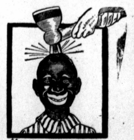
IT DOESN'T NEED AN AXE

to convince intelligent people that we are in the position to supply all needs promptly, carefully, courteously, for most people in Mitchell county know that we have a good stock of tools, nails, screws, and every other little and big thing they have a right to expect to find in a first class hardware store, which ours is.