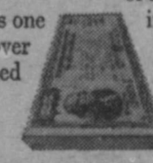
If they're lost, stolen, or destroyed, we replace 'em.

However you look at it, it simply makes a lot of sense to invest in your country. After all, it's the only country you've got.