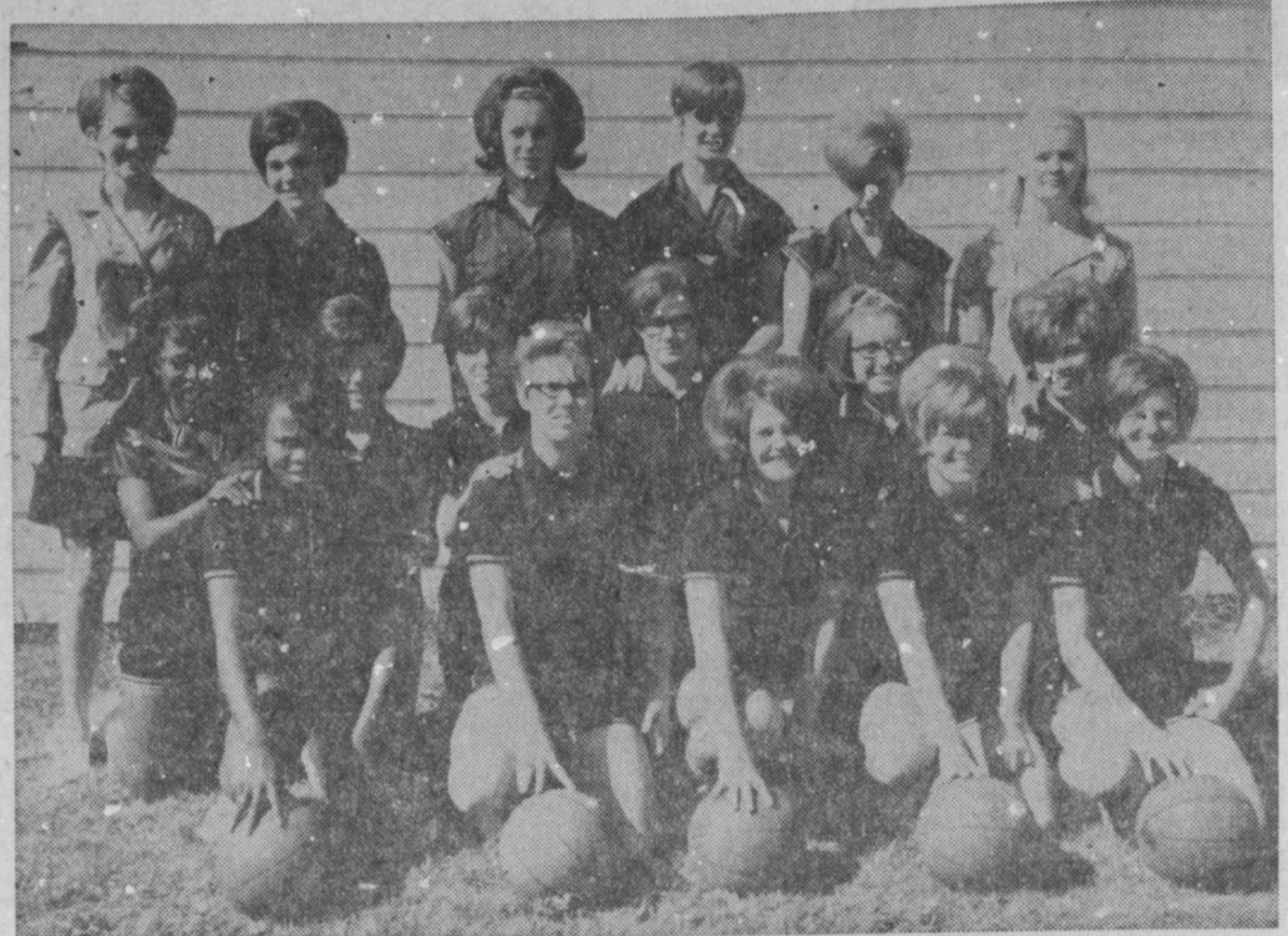
1968 - 69 GIRLS BASKETBALL TEAM