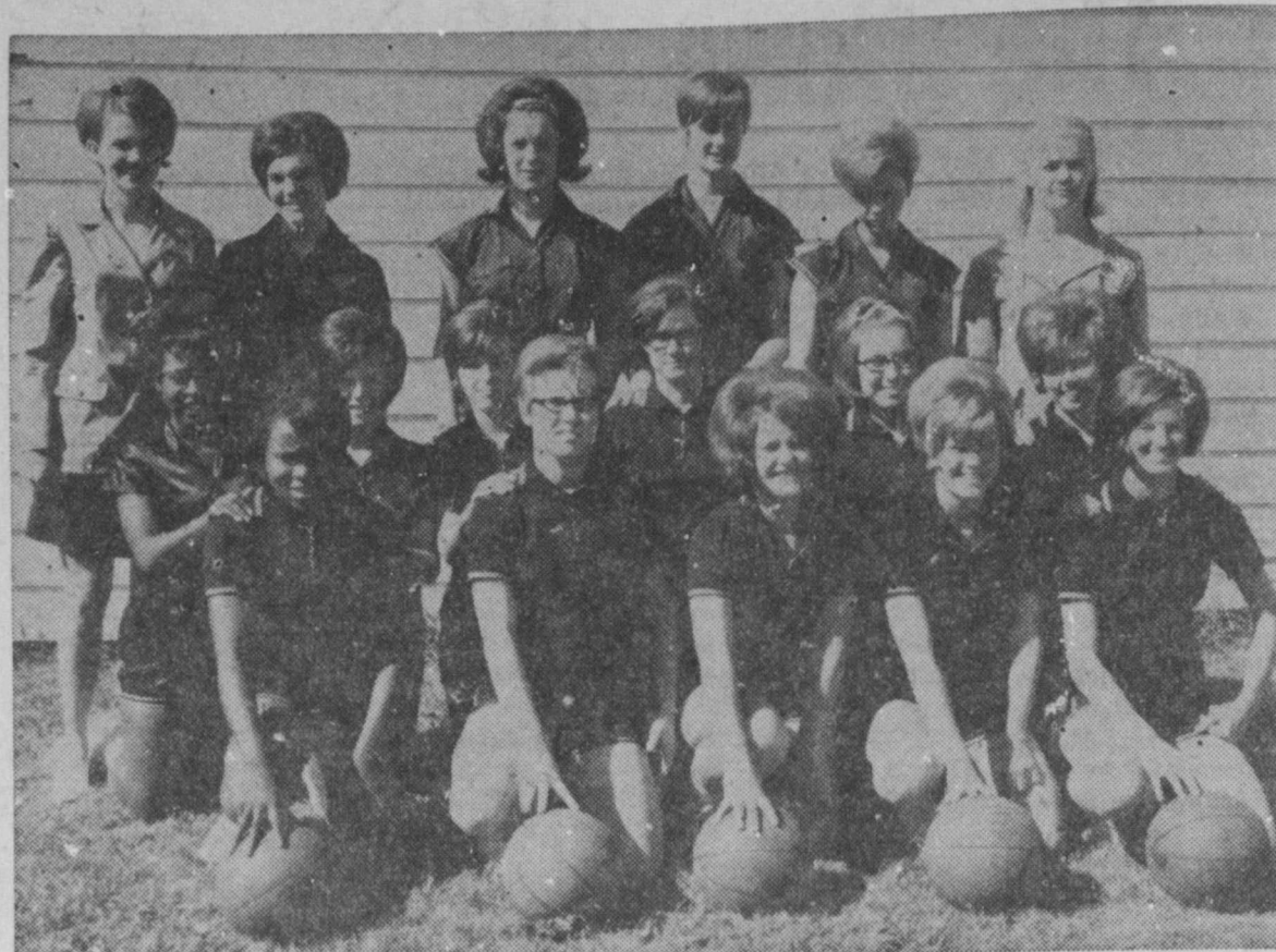
1968 - 69 GIRLS BASKETBALL TEAM