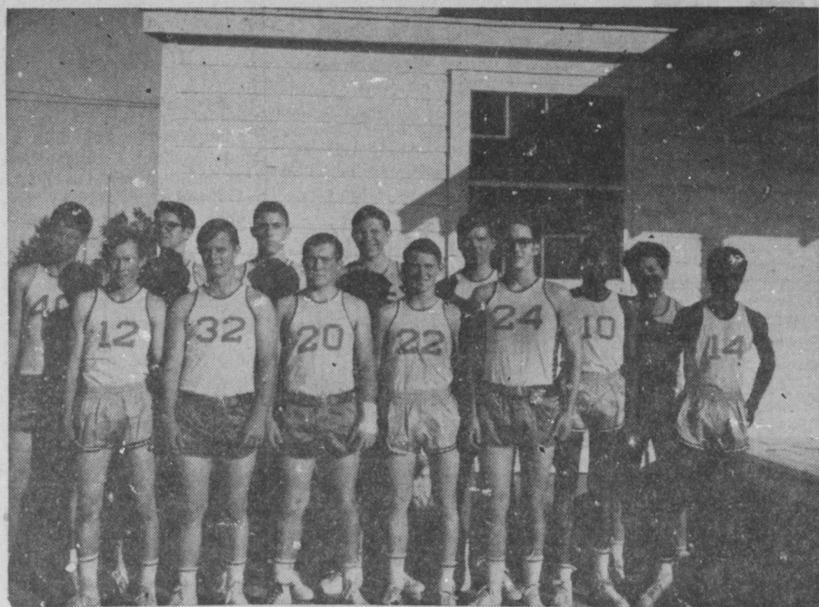
1968 - 69 BOYS BASKETBALL TEAM