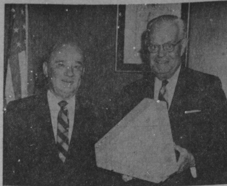
URGES EMBLEM USE — Col. Homer Garrison (right), director of the Texas Department of Public Safety, has joined with the Texas Farm Bureau in urging operators of "slow-moving vehicles" such as farm tractors and road construction equipment to display special luminous "SMV" warning emblems on the rear of the equipment. Shown with Garrison is C. H. DeVaney, Waco, president of the 95,000-member Texas Farm Bureau.

Texas Water Pollution Control Board wants to expand its operations from 10-12 employees and a budget of $62,528 in 1967 to 86 employees and $1,402,159 in 1968 — and 194 employees with $2,675,910 in 1969.