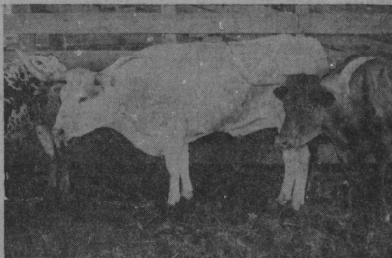
The Centennial Trail Drive ended at the market that replaced the long trail drives to Kansas of one-hundred years ago. The longhorn cattle shown above made the recent historic trail drive sponsored by the Texas Longhorn Breeders Association from San Antonio to Dodge City, Kansas. They were then returned to the Union Stock Yards San Antonio. The trail drive followed the same route the cattle drives of one-hundred years ago followed to find a market. With the development of livestock markets like Union Stock Yards San Antonio, the long cattle drives no longer were necessary. This cattle drive brought the attention of the whole country to the cattle industry.