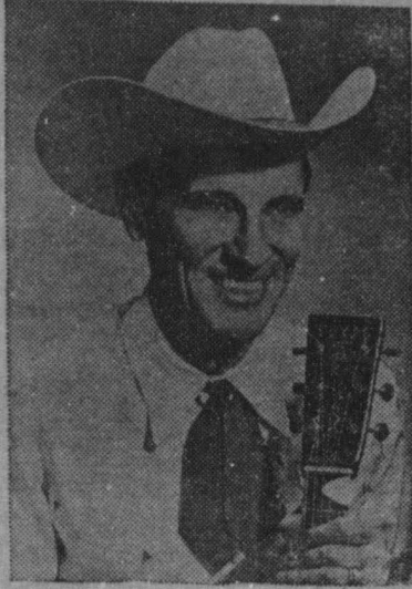
ERNEST TUBB ... "Texas Troubadour"

The Rowena Volunteer Firemen have announced completion of plans for bringing to Rowena, Ernest Tubb and Band of the Grand Ole Opry Show. The world renowned "Texas Troubadour" is one of the all time greats in the music industry and his legion of fans and phonograph record sales number into the countless millions.