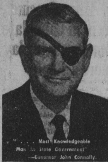
Most Knowledgeable Man In State Government —Governor John Connally

One man stands tall as THE qualified candidate in the Attorney General's race. He is so obviously the best choice that more than 75 newspapers have endorsed him over two young opponents.