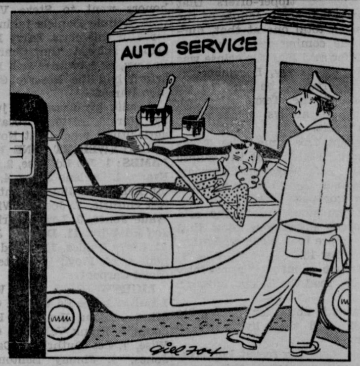
"Oh That . . . Good Grief! My Husband Was Painting the Garage Ceiling!"

Speaking of painting . . . we don't wash your paint off, only the dirt. Honestly, you'll hardly believe it's the same car, when you see the fresh-from-the-showroom gleam wel'll give it. You'll drive out with the same thrill of pride your car gave you when it was brand new!