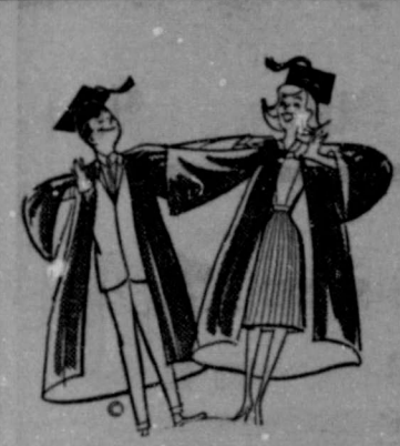
The Time of Their Life! ON YOUR CREDIT