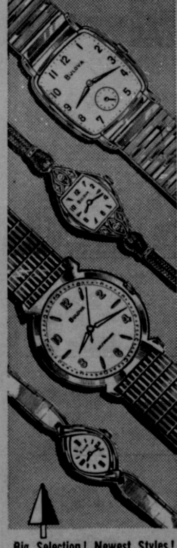
Big Selection! Newest Styles!

Give Your Graduate the Best - Select from Most Lavish Collection of Fine Watches in Area.