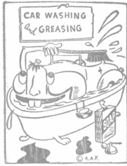
"Come on in, the washin's fine."

original Ten Commandments. Car washing and lubrication are specialized services with us We have the right lubricant and we KNOW where it should go. When we wash your car we you ever run up against a ma-CLEAN IT inside and out. thematical problem that stump-