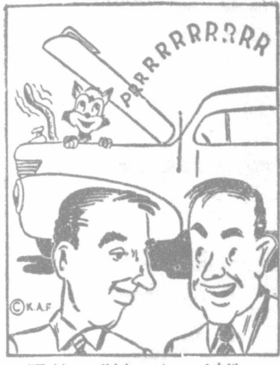
"Told you I'd have it purrin' like a Kitten."

It takes good gasoline, the proper oil to keep a motor running in top shape -- to make it "purr." For lubrication and carwashing too ... see us.