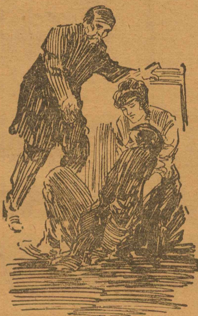
"He Is My Soldier."

"Mine Gott, ya; I sa dot airecty," fervently. "He tell you not reconno-