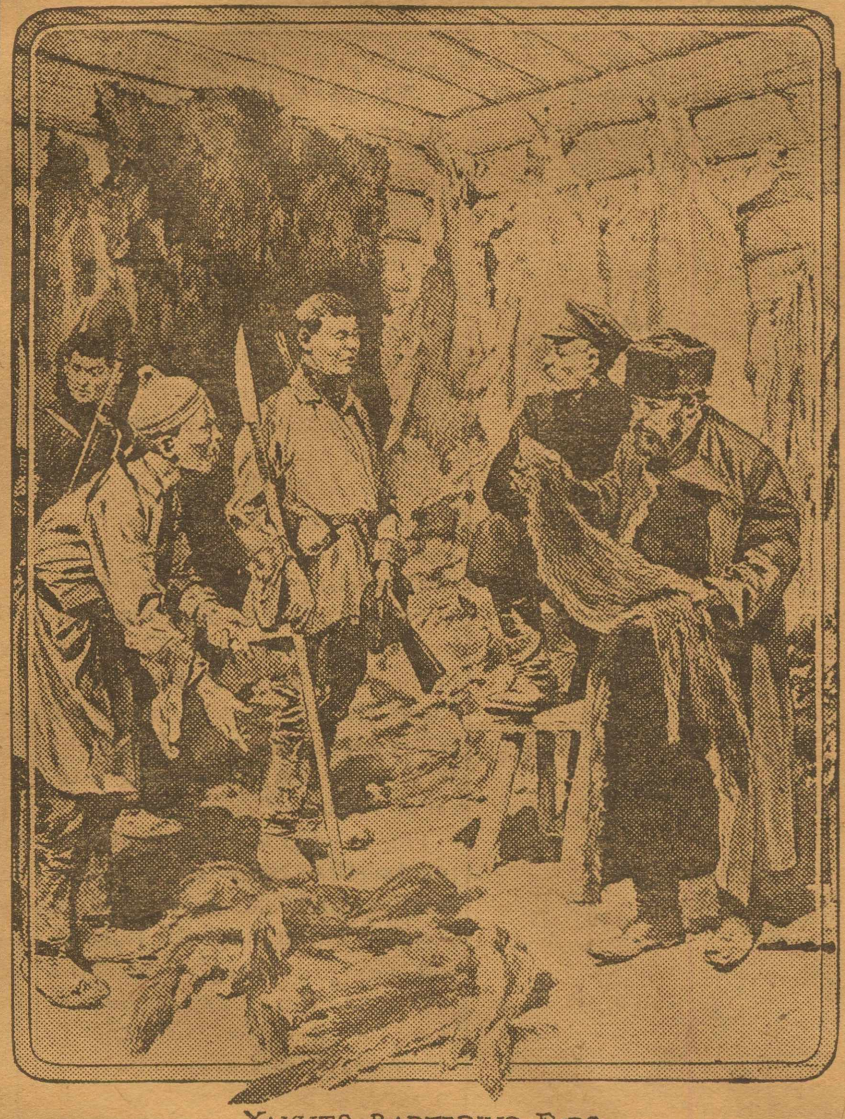
YAKUTS BARTERING FURS

Melt 21/2 cups of sugar to a sirup. When cold add one-half cup of lime fuice, two cups of pineapple cut in small pieces, one-half cup orange juice. Dilute with water and serve a ray of light. In glasses of crushed ice.