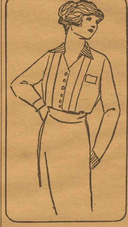
Linen With Striped Collar,

Those summer blouses of lacy fabric mounted over flesh tinted net or chiffon to increase the effect of transparency are almost shockingly sheer. and the decollette cut of many of the waists, designed for wear with tailored street suits, is also rather shocking to old-fashioned propriety which believes that a shirtwaist intended for general utility wear should be rather humble and withal a very modest and unostentatious little garment. But no one can say that the new blouses are not pretty. Never has the separate waist been as becoming as it is at this moment, and one of these new lace or net blouses chic with its touch